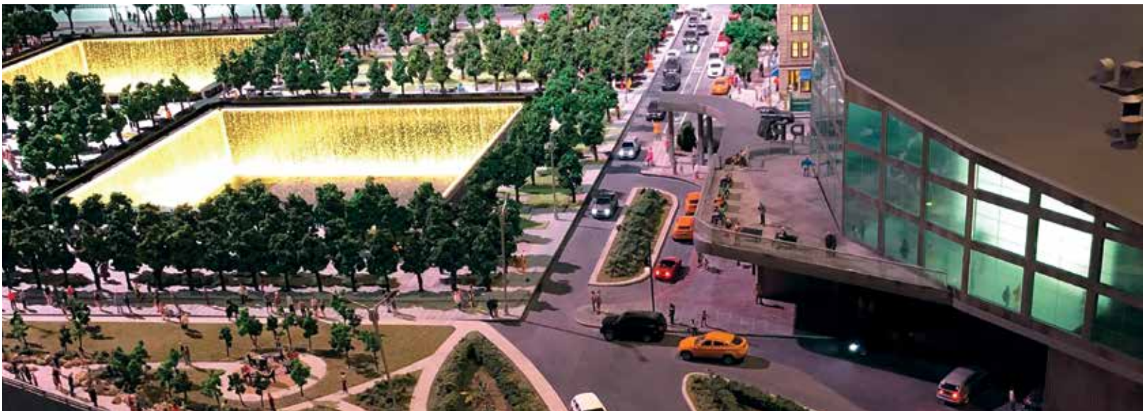
■ As we traveled the world at Gulliver's Gate, we located the site of the 9-11 Memorial.

If you wish to contribute to the exhibit, contact Patricia Mack at CSA: (212) 823-2080