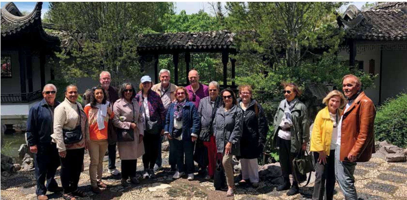
■ During the Retiree Chapter members' visit of Snug Harbor's Chinese Sculpture Garden on Staten Island they were able to explore eight pavilions, a bamboo forest path, waterfalls, a Koi filled pond, Chinese calligraphy, and a variety of Ghongshi scholar's rocks.